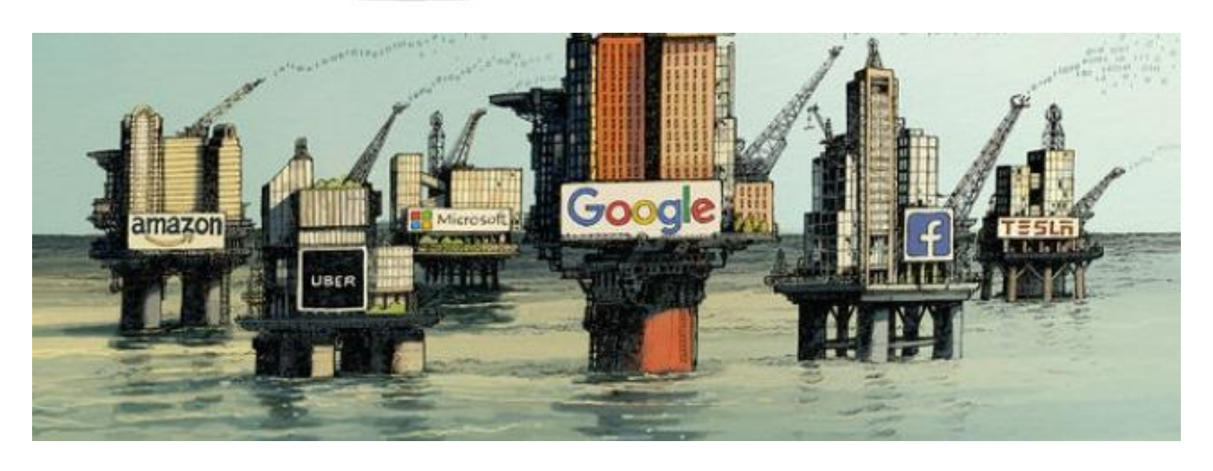
The Economist, June 2017